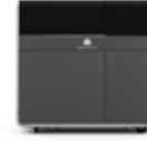
Projet MJP 2500 Plus