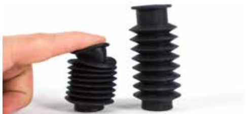
Visijet M2 EBK