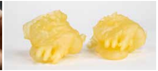
Visijet M2 ENT