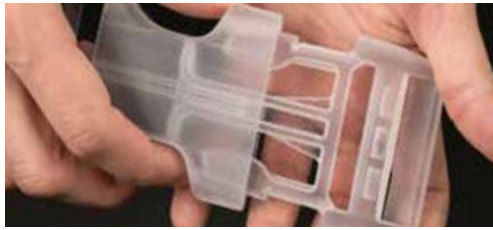
Visijet Armor M2G-CL

Functional precision plastic and elastomeric parts with the Projet® MJP 2500 Series