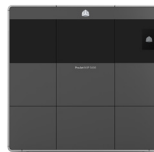
ProJet MJP 5600