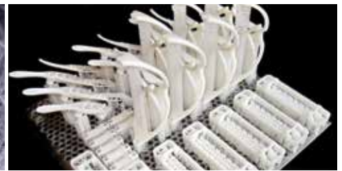
Visijet SL Impact