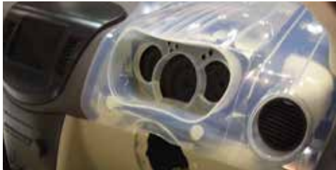
Various Accura materials for form and fit tests of a dashboard

Plastic and composite parts made from Accura SLA materials are the industry's "gold standard" for accuracy, providing excellent resolution, surface finish and dimensional tolerances. Accura SLA materials offer the broadest choice of materials in 3D printing and can easily be optimized for specific prototyping, casting, tooling and direct manufacturing applications.