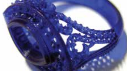
Visijet SL Jewel