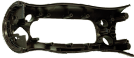
Visijet SL Black

The wide range of Visijet SL engineered materials offers the toughest and the highest quality parts to meet a broad range of commercial and production applications.