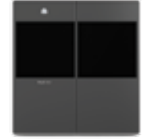
Projet® 6000 SD, HD & MP