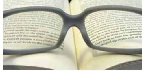
Visijet SL Tough (frame) and Visijet SL Clear (lenses)